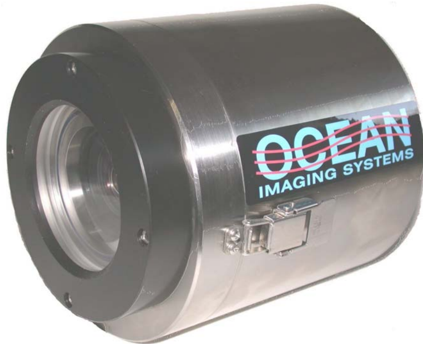
The DSC 12,000 Housed in a 6,000 Meter Titanium Housing